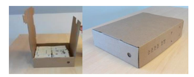
Box measuring 70 x 40 x 9cm

The new lodgement standard for banknotes necessitates the use of a secure box that can hold 50 one-hundred-note bundles, whatever the denomination. All lodgements of denominations ranging between €5 and €50 will only be accepted if they are packaged in complete uniform boxes, i.e. in 50 one-hundred-note bundles of a given denomination. However, for the three largest denominations, the centres will accept incomplete boxes that contain one-hundred-note bundles of different denominations, in keeping with the minimum lodgement quantity for these highdenomination banknotes. In the case of low volume lodgements, and with the exception of the new currency management centres, the centres may accept sleeves containing anywhere between one and ten one-hundred-note bundles of the highest denominations or from customers accredited by the Banque de France. However, the new cash management centres will only ever accept banknotes packaged in boxes.