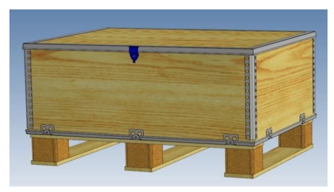
The Banque de France will gradually introduce collapsible, reusable wooden chests measuring L80 x I60 x H40cm for all coin-based operations

However, they will need to acquire the plastic seals and plugs to close the chests securely for deposit with the Banque de France. These seals will prevent tampering and ensure that operations can be traced. The names of the suppliers of such seals can be obtained from the Banque de France.