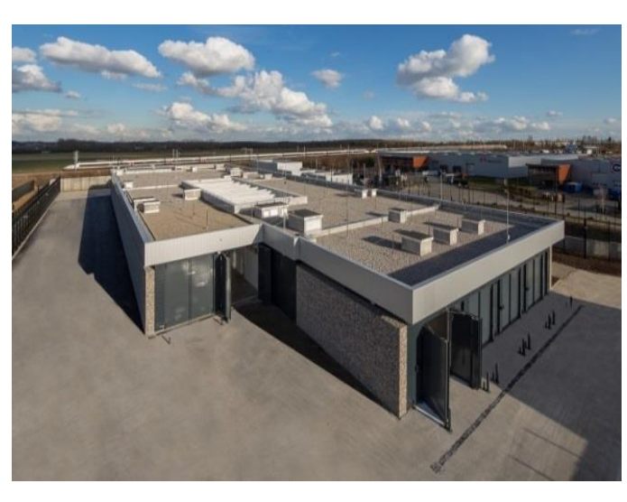
The cash management centre for the north of France(Cefinof), under construction close to Lille

Angoulême and La Rochelle: 1 September 2017